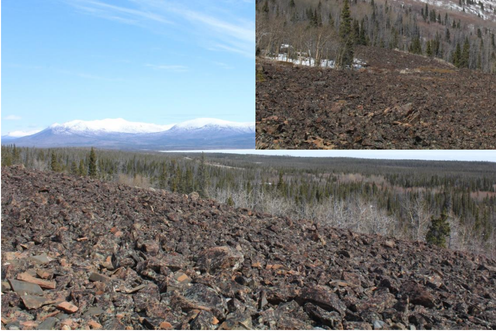
Bold Eagle – Desadeash lake