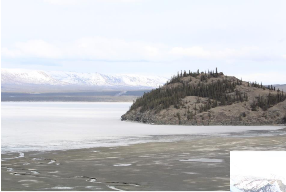
Soldier Summit –Kluane Lake